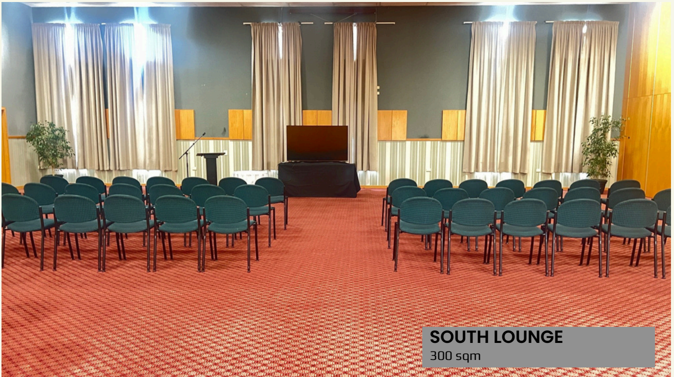
SOUTH LOUNGE 300 sqm