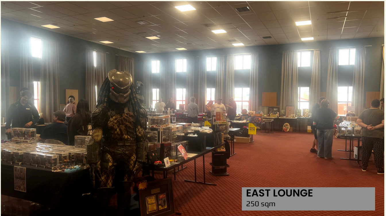
EAST LOUNGE 250 sqm